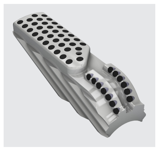
The cement cleanout block effectively clears cement from casing without contacting the casing ID.

Because flow through the tool activates its cutter blocks, flow should be halted whenever the tool passes restrictions that are smaller than the tool's diameter with its cutter blocks deployed.